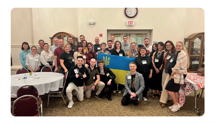
Organized three community events: Kolodii, Independence Day, and the Ivan Kupala camp.

The Ukrainian community of Richmond has more than 1,000 people , with more than 20 families joining the community in 2024.